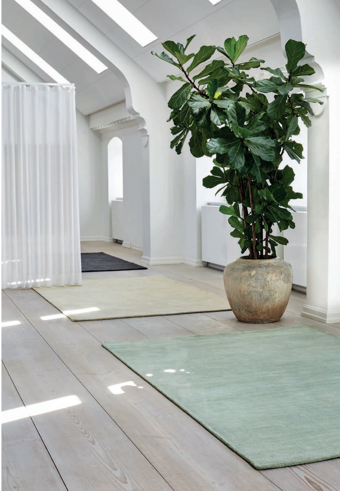
REPEAT | Pistachio, pastel yellow, graphite