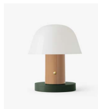
→ Nude & Forest