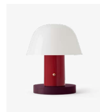
→ Maroon & Grape