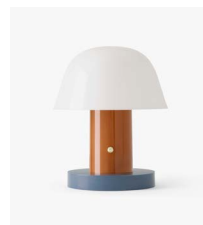
→ Rust & Thunder